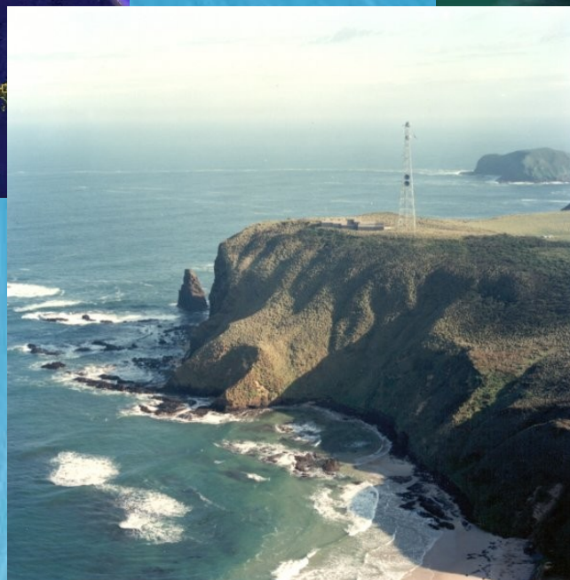
GRUAN, Lindenberg, February