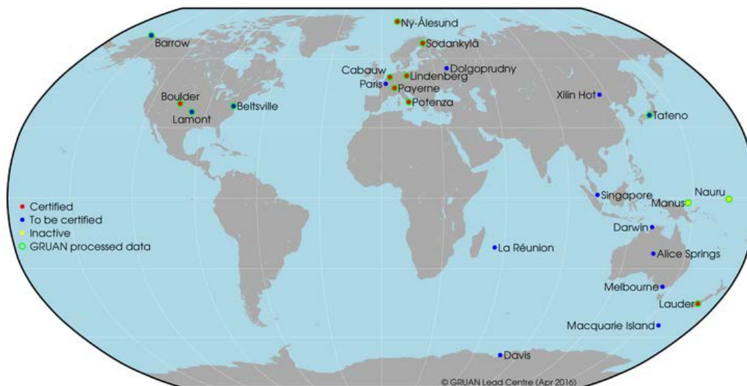
Figure 2. Current GRUAN network configuration as of April 2016.

The methodological aspects that underpin what shall constitute a GRUAN reference measurement are documented in the peer reviewed literature (Immler et al., 2010), and data adhering to these principles are being processed and served for one specific type of radiosonde instrument (Dirksen et al., 2014) flown at a subset of the sites and served through NOAA’s National Centers for Environmental Information. Reference quality data are close to being ready for a number of additional measurement techniques.